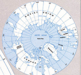
Arctic Equidistant projection Polar Map Scale: 1:10,000,000 Along meridians only

UNITED STATES DEPARTMENT OF THE INTERIOR GEOLOGICAL SURVEY THE WORLD Produced by the United States Geological Survey 1983