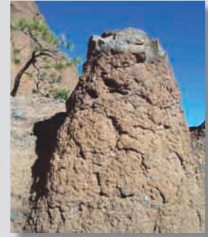
The amphitheater of Red Mountain has many "hoodoos" (left, center foreground), rather bizarre landforms that are especially common in the western part of the amphitheater. These 10- to 20-foot-tall, upward-tapering earth pinnacles of cinders are capped by 1- to 3-foot-wide boulders of dense lava. The boulder "sbrero" capping each pinnacle (see above) protects the underlying cinders from erosion. These hoodoos and other odd-looking spires, ridges, and ribs found in the amphitheater were almost certainly sculpted by water and wind erosion.

a fountain of frothy lava that may spray as high as 2,000 feet into the air.