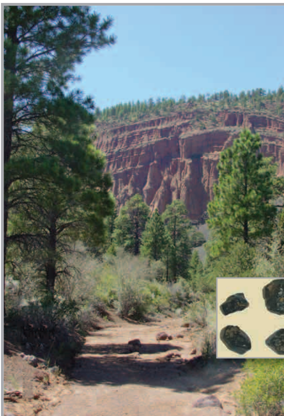
This alluring view shows the foot trail leading to the amphitheater of Red Mountain. Roughly the last half of the foot trail follows a normally dry stream bed. The stream sand includes countless black shiny grains, a few as large as walnuts (see inset). These grains are sometimes mistaken for "Apache tears," which are composed of obsidian, the volcanic glass highly valued by ancient cultures for crafting arrowheads, knives, scrapers and other tools. However, the abundant black grains at Red Mountain are crystals of minerals (pyroxene and amphibole) eroded from the volcano. A close look at the walls of the amphitheater will reveal crystals of these minerals still embedded in cinders, waiting to be plucked out by water and wind erosion.

During the waning stage of an ideal cinder-cone eruption, the magma has lost most of its gas content. This gas-depleted magma does not fountain but oozes quietly into the crater or beneath the base of the cone as lava. Because it contains so few gas bubbles, the molten lava is denser than the bubble-rich cinders. Thus, it burrows out along the bottom of the cinder cone, lifting the less-dense cinders like a cork on water, and advances outward, creating a lava flow around the cone's base. When the eruption ends, a symmetrical cone of cinders sits at the center of a surrounding pad of lava.