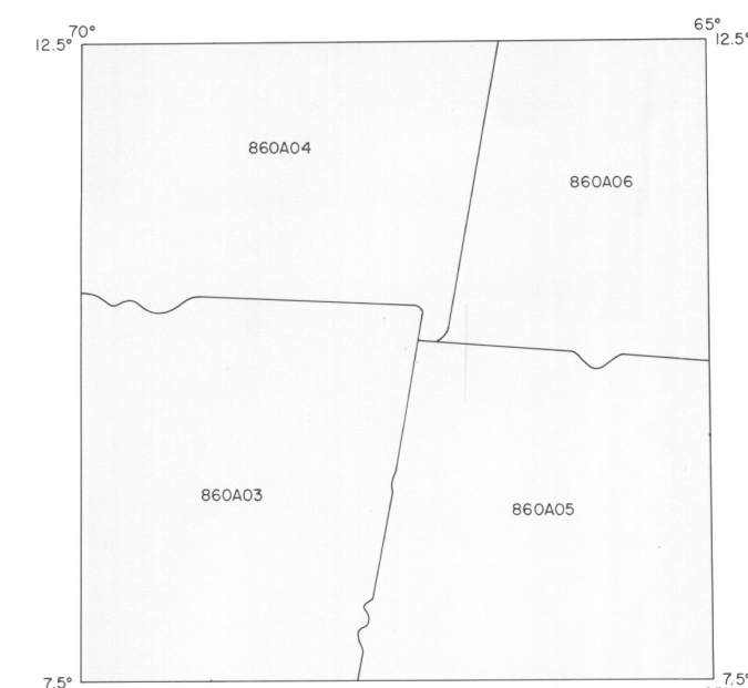
INDEX OF VIKING PICTURES The mosaic was made with the Viking pictures outlined above. Copies of various enhancements of these pictures are available from National Space Science Data Center, Code 801, Goddard Space Flight Center, Greenbelt, MD 20771.