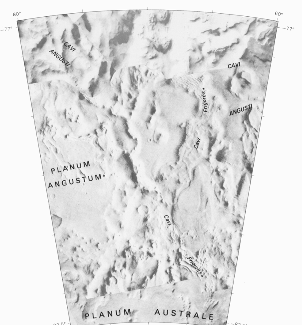
LOCATION OF FEATURES Contrast in the reduced base mosaic was purposely suppressed to emphasize the names.