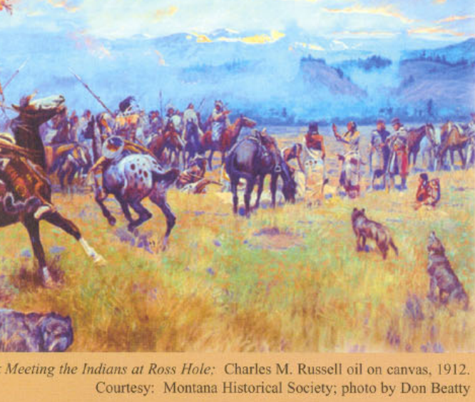
Lewis and Clark Meeting the Indians at Ross Hole: Charles M. Russell oil on canvas, 1912.