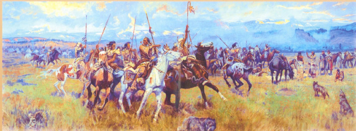
Lewis and Clark Meeting the Indians at Ross Hole: Charles M. Russell oil on canvas, 1912.