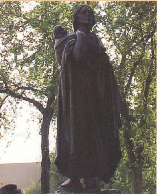
Statue of Sacagawea on the Capitol Grounds in Bismarck, North Dakota

Note: There are a variety of pronunciations of the name of the young Indian woman who accompanied the expedition, and all are dependent on the location. The Mandan, Hidatsa, and Arrikara used "Sakakawea" and "Sacagawea"; the Shoshone used "Sacajawea." There are also numerous spelling variations used by Lewis and Clark in their journals.