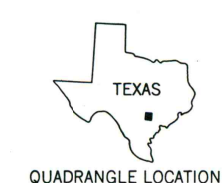
QUADRANGLE LOCATION 2997-114